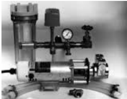
Flowlight™ Booster Pump, with optional E-Z Installation Kit and 5 Micron Filter & Housing

The Standard Booster Pump model has the highest flow and should be used where suction lift is less than 10 feet. The Low flow model has a higher pressure capacity and should be used where suction lift is greater than 10 feet or where suction pipe is less than 1" inside diameter. Maximum suction lift is 20 feet at sea level.