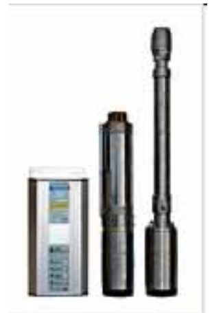
LORENTZ PS left: Centric (C) right: Helical Rotor (HR)